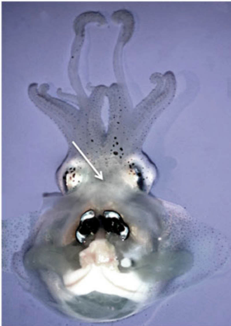
Figure 1. Adult Hawaiian bobtail squid Euprymna scolopes showing position of cephalic blood vessel.

Because cephalopod hemolymph contains extracellular hemocyanin and not hemoglobin, upon oxygenation, the hemolymph will turn dark blue. An average of ~5000 hemocytes per \mu\text{l} of hemolymph will be obtained using this method. After adherence to the chambered cover slips and fluorescent staining, the hemocytes should appear brightly fluorescently red and amoeboid in shape. For bacterial adhesion, V. fischeri will adhere poorly to the hemocytes (1-2 bacterial cells per blood cell) while V. harveyi will adhere strongly (10-15 bacterial cells per hemocyte).