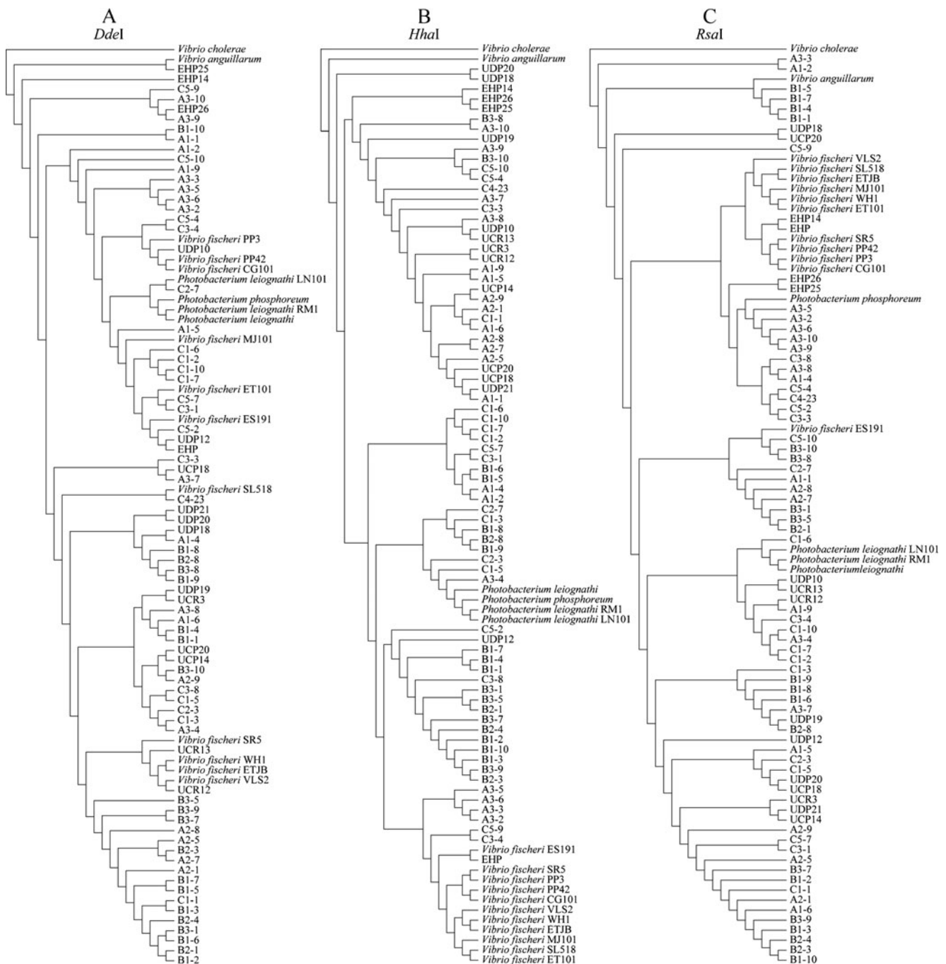
Figure 3 Dendrograms built from restriction profiles using parsimony implemented in POY 4.0. Refer to Table 1 for isolates names

sister taxa (Fig. 3c). Not all mutualistic Vibrio isolates appear in this group, with free-living V. fischeri WH1 grouping separately with Thailand strains.